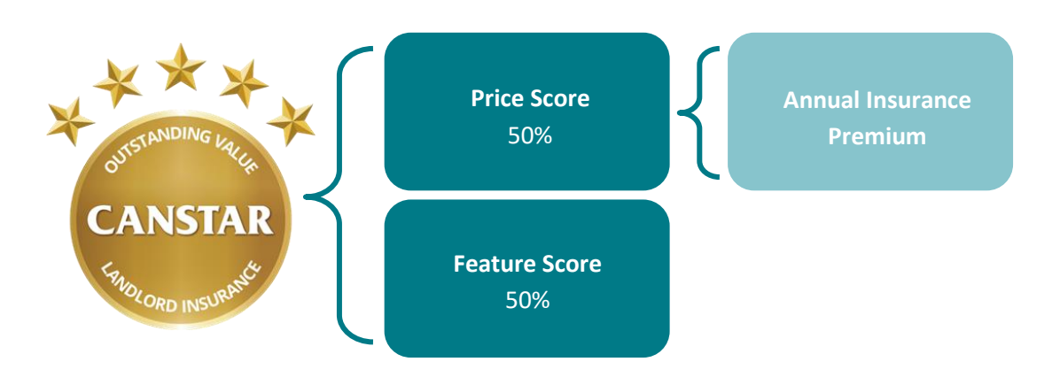
Total Score = Price Score + Feature Score

To arrive at the total score, Canstar applies a weight against the price score and the feature score. The weights reflect the relative importance of costs and features in determining the products offering outstanding value. This method can be summarised as: